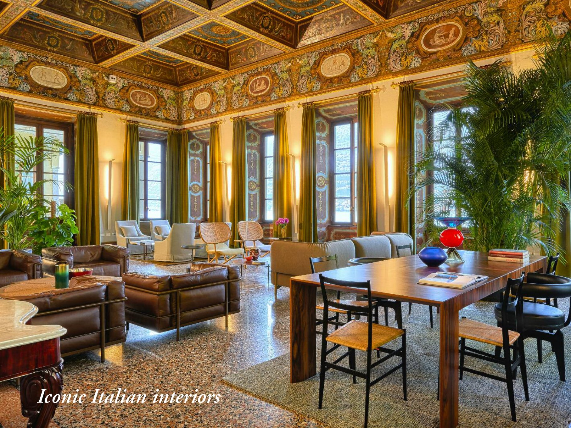
Iconic Italian interiors