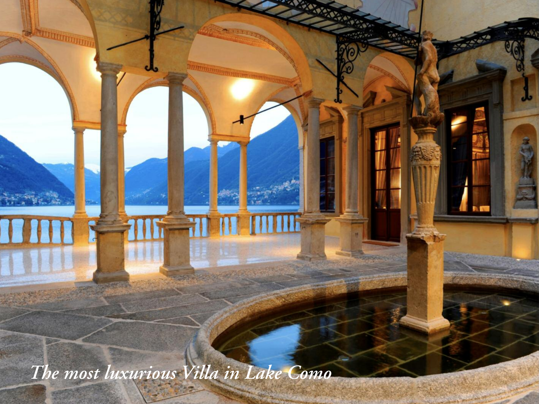
The most luxurious Villa in Lake Como